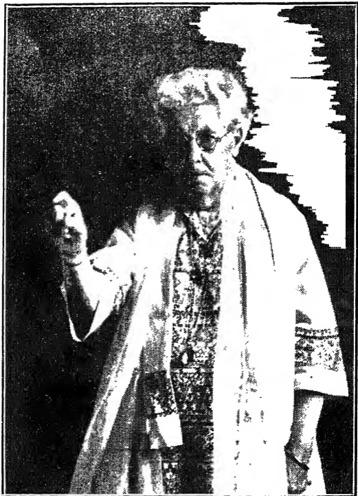
DR. ANNIE BESANT